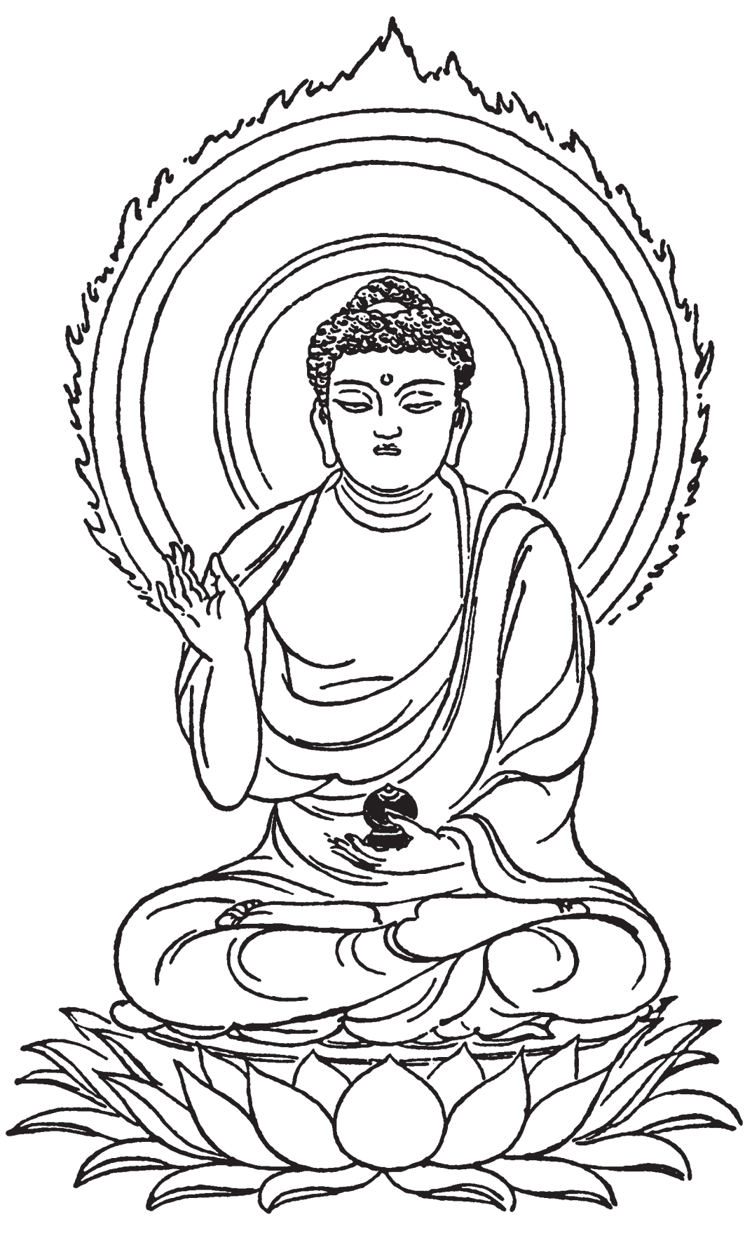
Bhaishajyaguru (Yakushi Nyorai)