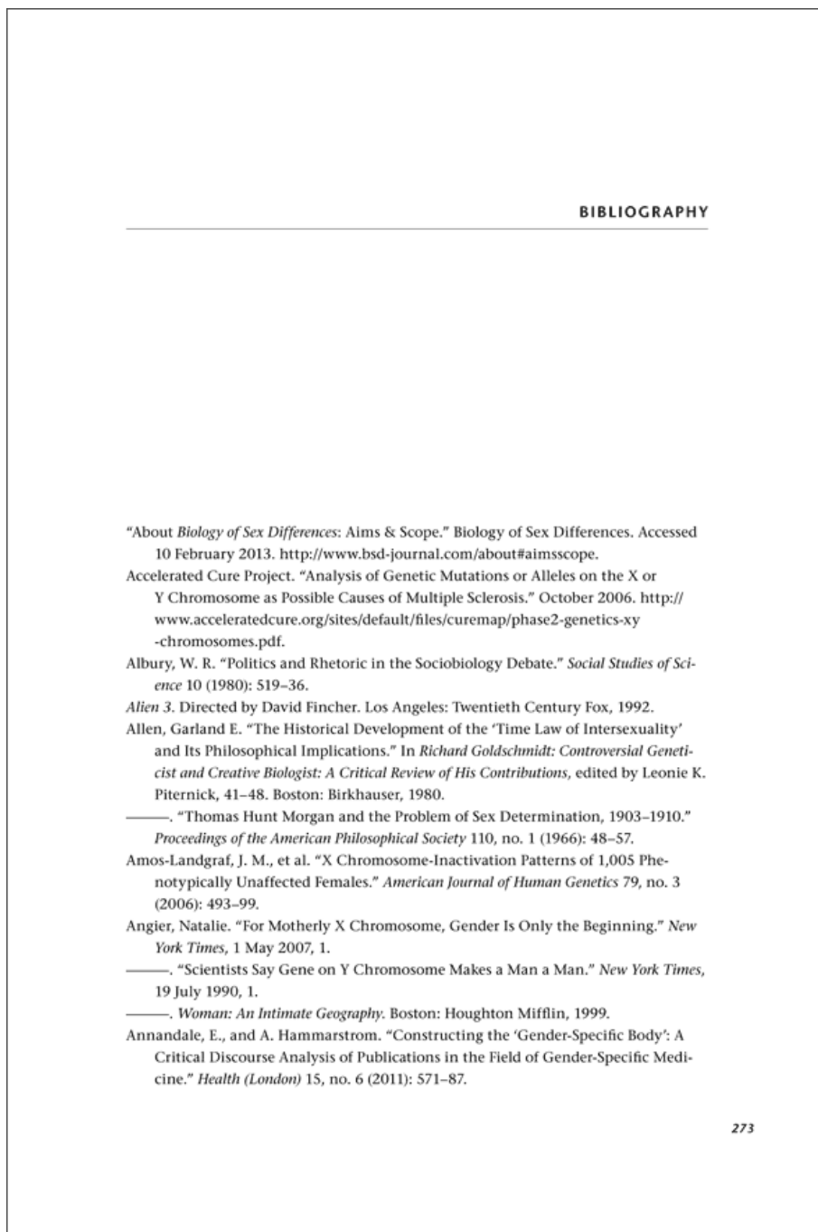
Figure 14.8: The first page of a bibliography for a book. See 14.62.