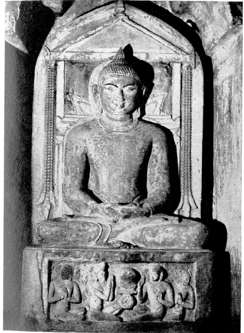
Plate IV Nagayōn Corridor—Nārada and the Jāṭila