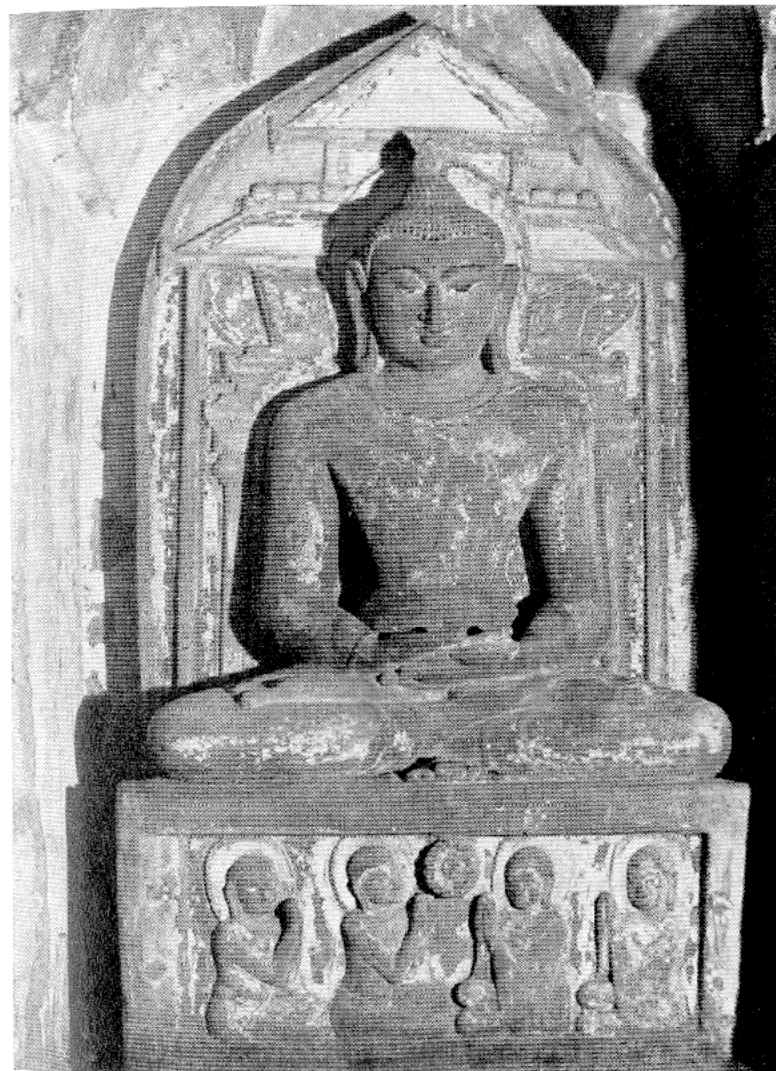
Plate VIII Nagayon Corridor—Gotama and Ajita.