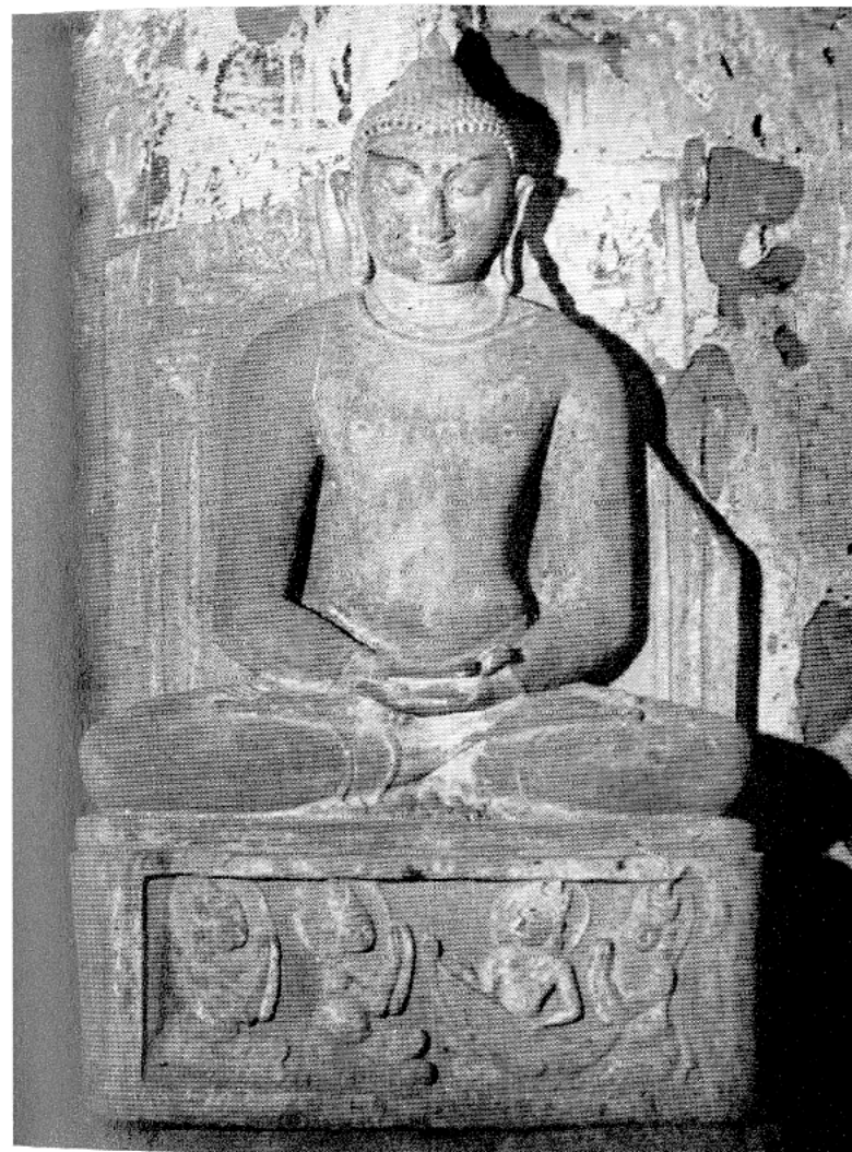
Plate VI Nagayōn Corridor—Dhammāassin and Sakka Purindada.