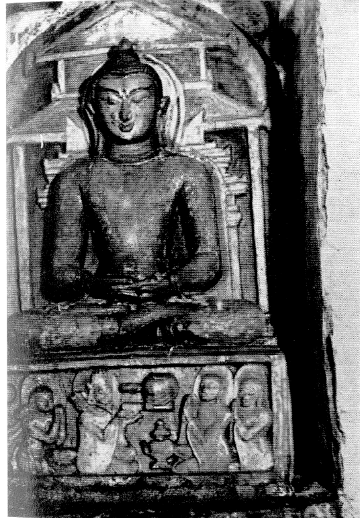
Plate VII Nagayon Corridor Sikhin and Arindama.