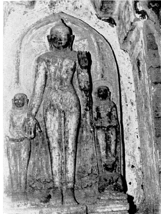
Plate I Nagayôn Corridor—Dīpaṅkara and Sumedha.